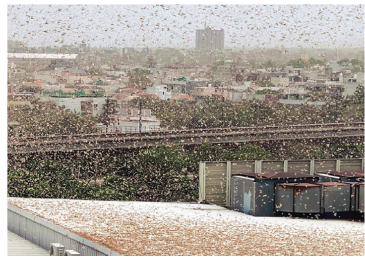
The skies over many parts of Gurugram turned dark as swarms of locusts descended on the city

It multiplies very rapidly and is capable of covering 150 kilometers